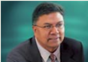
Group Chief Financial Officer

He read economics and law at Cambridge, graduated with a Bachelor of Arts degree in 1988 and was called to the English Bar (Lincoln's Inn) in 1989 and the Malaysian Bar in 1990.