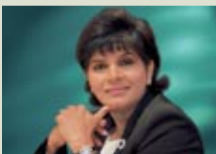
Group Company Secretary

He graduated from the University of Wales, UK with a Degree in Chemical Engineering. He was previously with the Shell group of companies in Malaysia, with more than 25 years of experience in the downstream oil market.