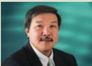
Executive Director Powertek Bhd

He is a Chartered Certified Accountant (United Kingdom) and a Certified Public Accountant (Malaysia).